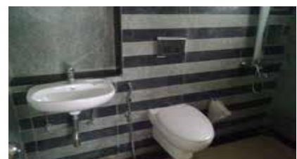
Water Closet with Dual Flush