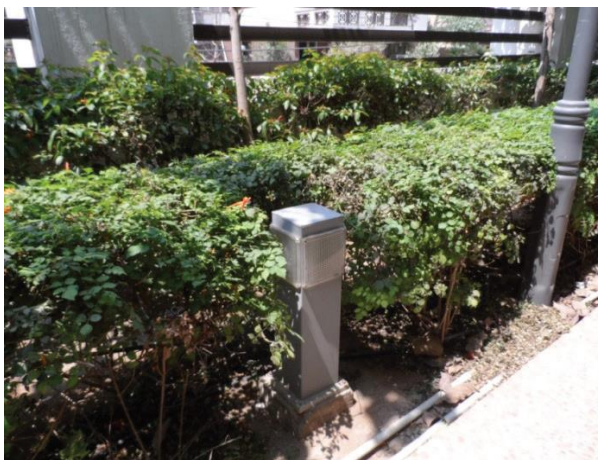
Bollard Light Fixture