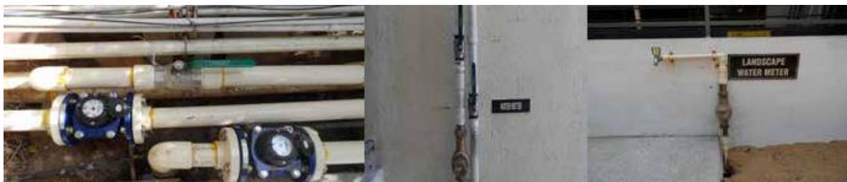
Water Sub Metering