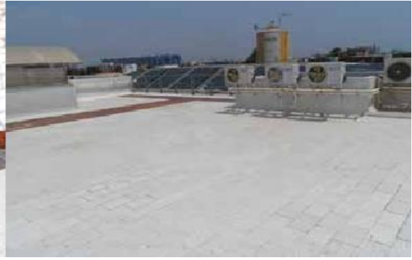
Heat insulating white tiles