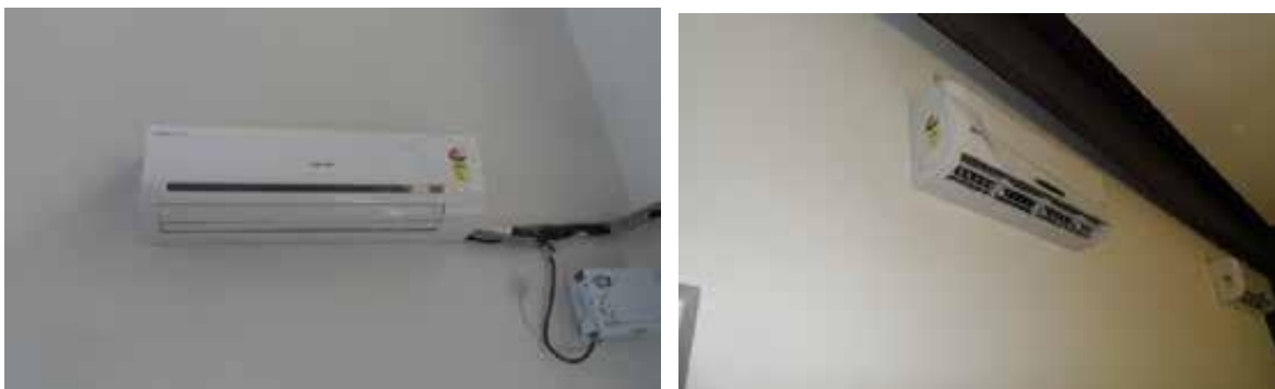
CFC Free and BEE 3 Star Air Conditioners in Common Areas