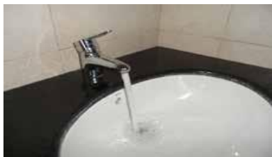
Water Efficient Fixture