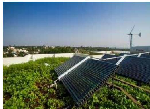
Individual Solar Hot Water System