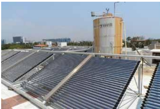
Centralized Solar Hot Water System

The society can claim 2 points under this credit.