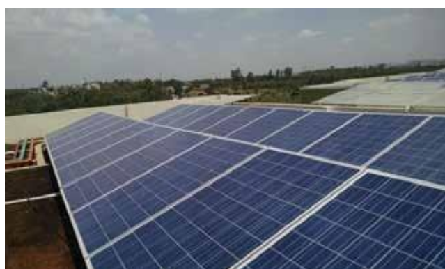
Centralized Solar-PV system for Street and Common area lighting