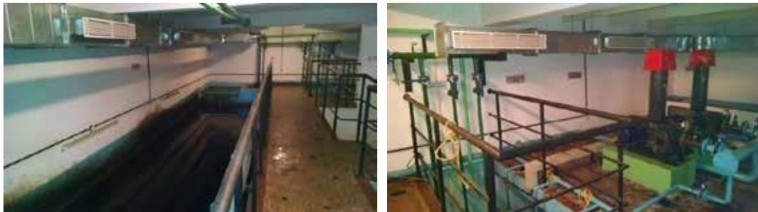
On-Site STP for treating wastewater