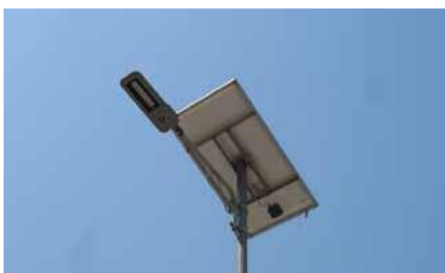
Stand Alone Solar-PV Street Lights