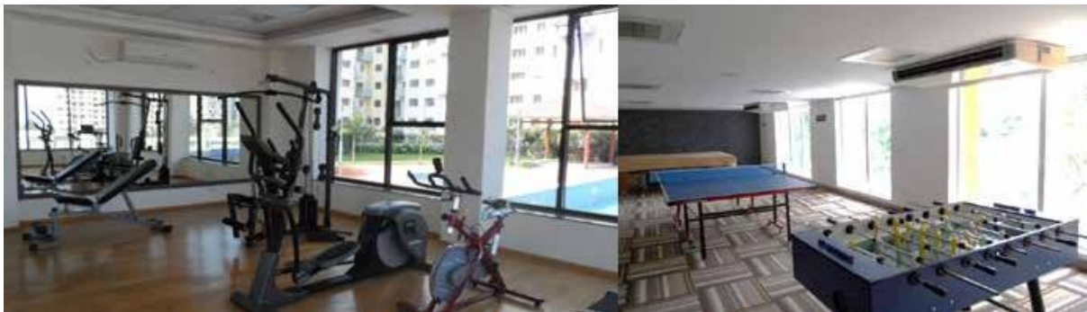
Facilities for Health and Wellbeing