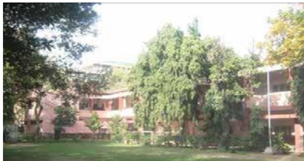
Greenery in site (Trees, Shrubs)