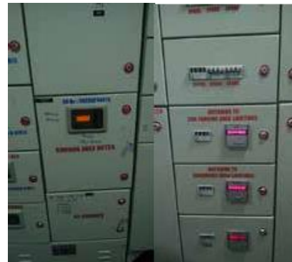
Energy Meters measuring Lighting and Equipment Loads