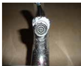
Faucet fitted with Aerator