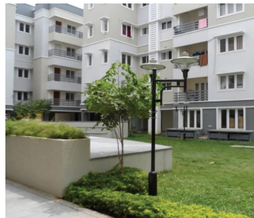
Covered Dome Light Fixture