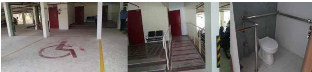
Design features for Differently Abled and senior Citizens