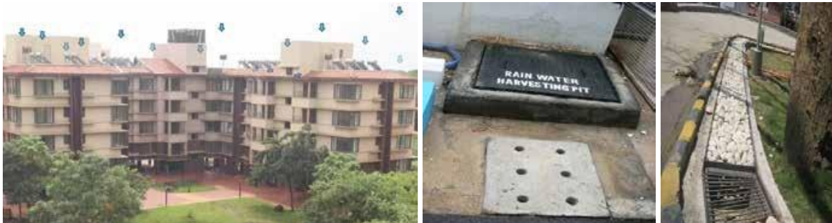
Rainwater Harvesting System