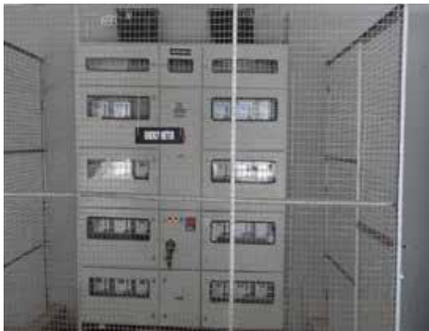
Energy Meters measuring Common Area Loads