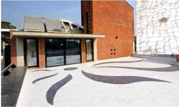
China mosaic tiles installed on Roof